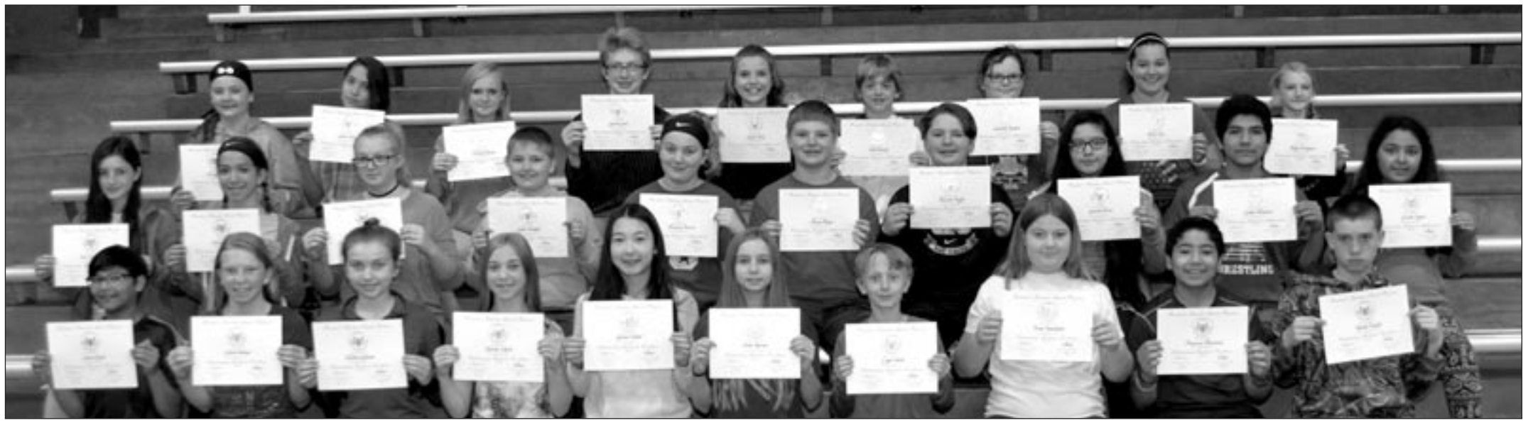
Enterprise photo by Kurt Menk