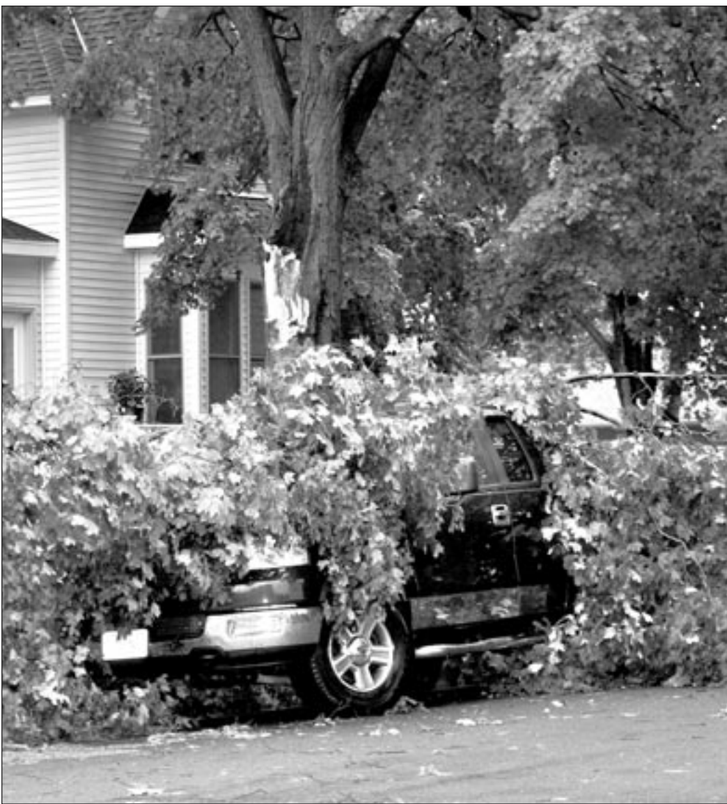
Enterprise photo by Kurt Menk